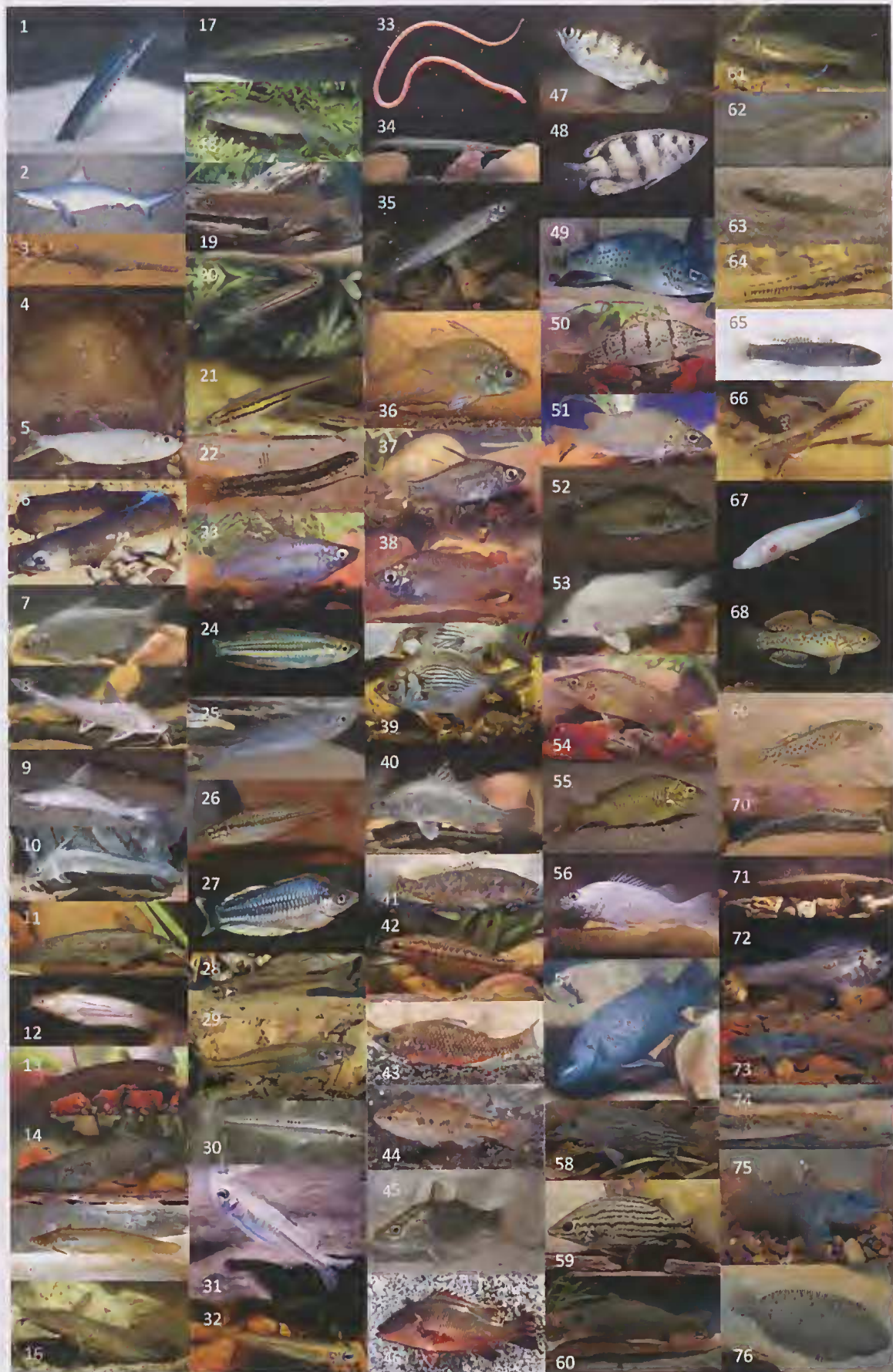
Figure 2 Fishes in fresh water habitats of Western Australia that spend all, or part, of their life-cycle in fresh water. Not pictured are the marine migrants, marine vagrants, estuarine vagrants, undescribed species, Milyeringa justitia or Kimerleyeleotris notata . Please refer to Table 1 for species names.